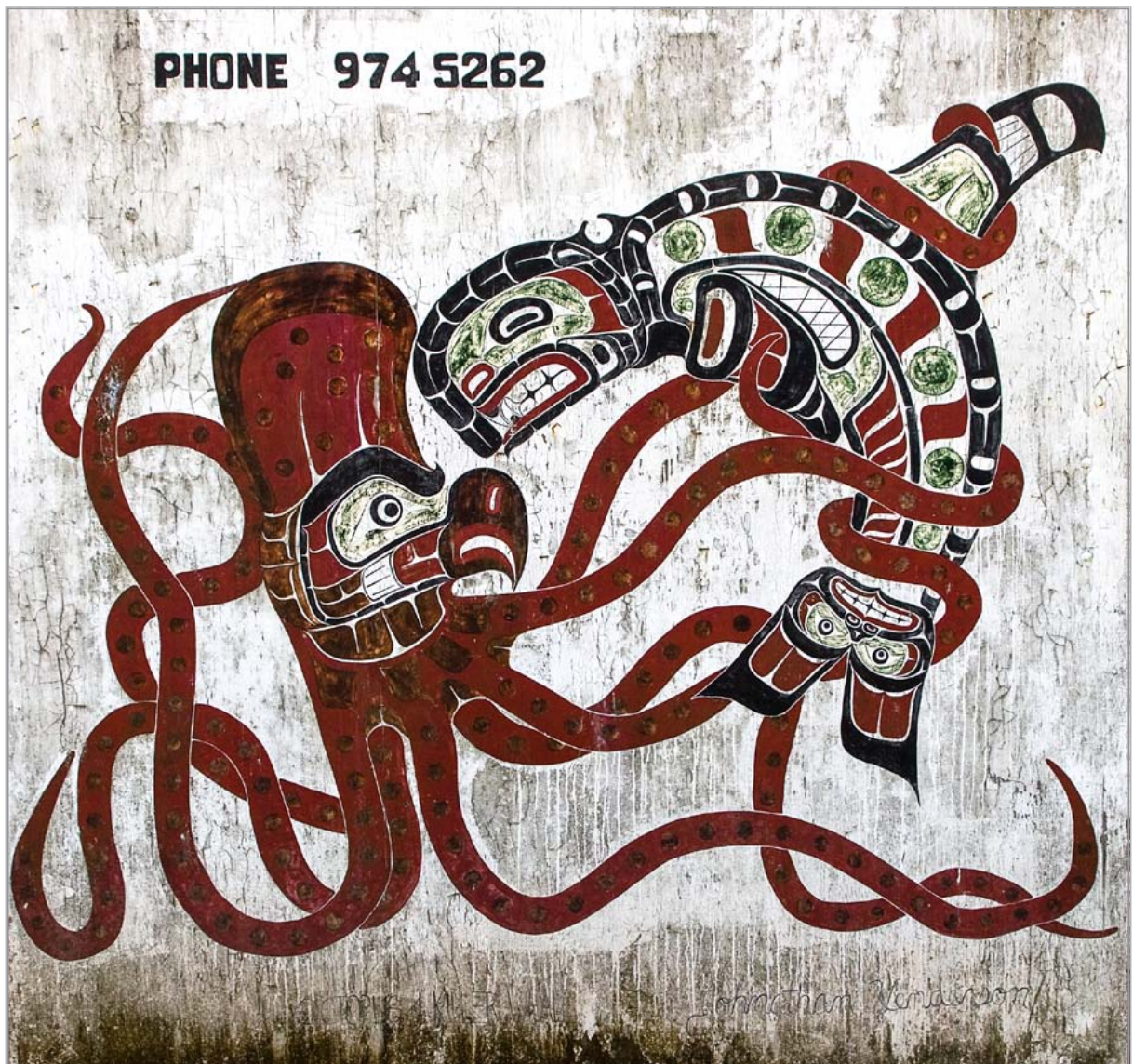
This wonderful painting was on the door of a disused fish plant. It was the first time I had seen a depiction of an octopus in any of the art of the west coast First Nations.