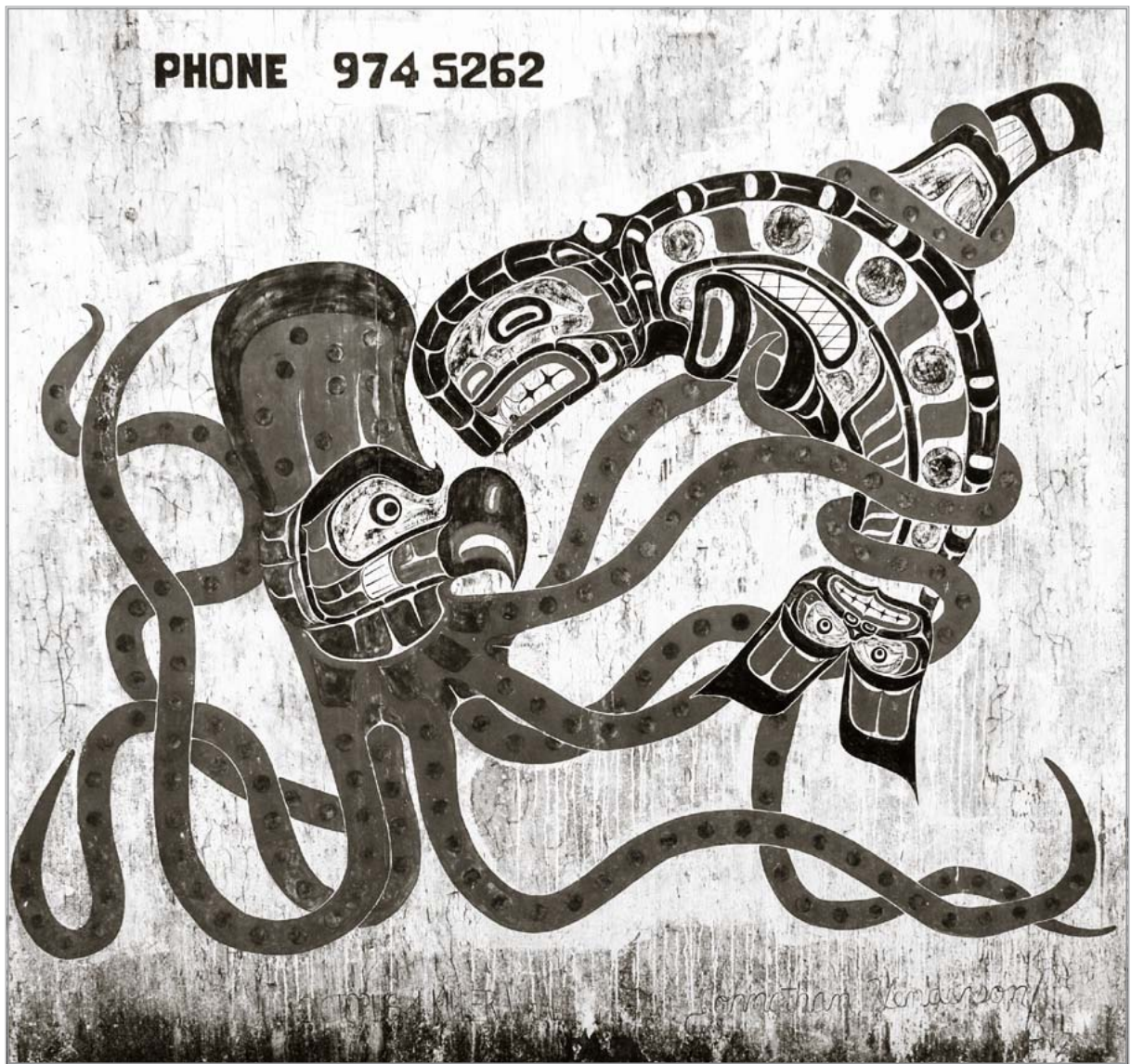
This wonderful painting was on the door of a disused fish plant. It was the first time I had seen a depiction of an octopus in any of the art of the west coast First Nations.